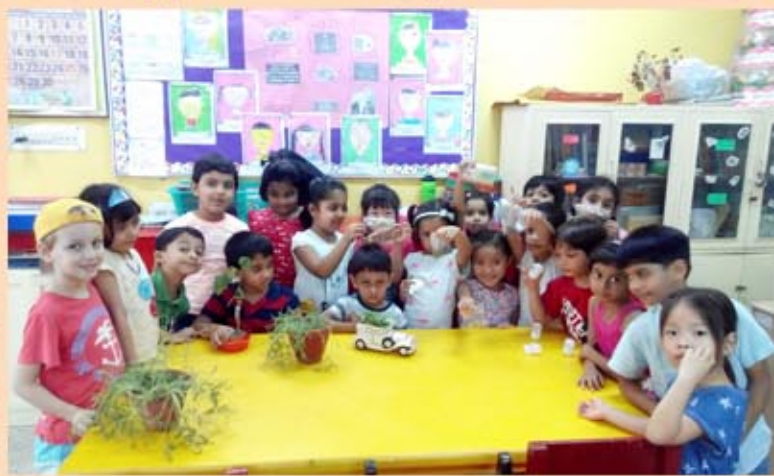
Learning about plants and seeds