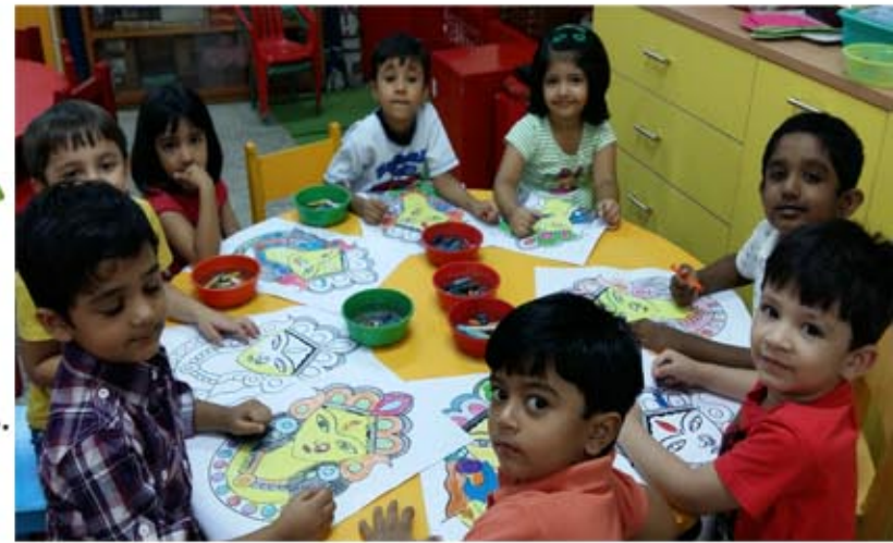
Getting ready for the festive season.

Turtles have been on the earth for more than 200 million years. They evolved before mammals, birds, crocodiles, snakes, and even lizards. The earliest turtles had teeth and could not retract their heads. Turtles live on every continent except Antarctica. Turtles range in size from the 4-inch Bog Turtle to the 1500-pound Leathery Turtle. The shell of a turtle is made up of 60 different bones all connected together. Turtles have good eyesight and an excellent sense of smell. Hearing and sense of touch are both good and even the shell contains nerve endings.