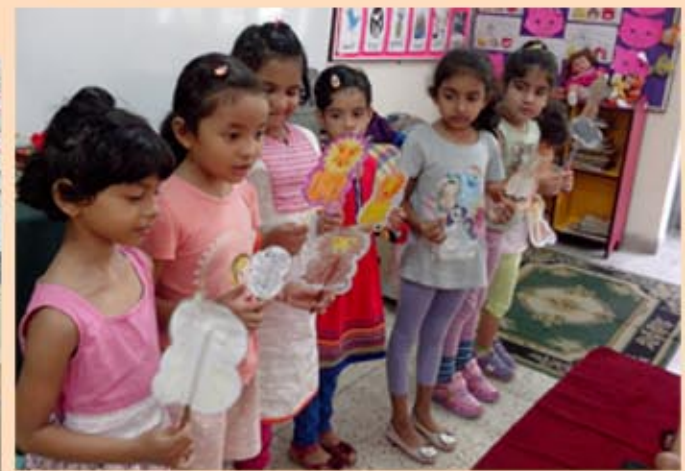
Narrating the story of "The lion and the mouse" with stick puppets