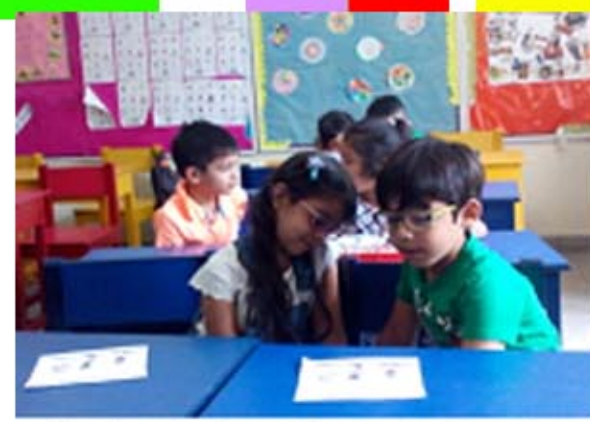
Sharing their stories in the Creative Writing class.