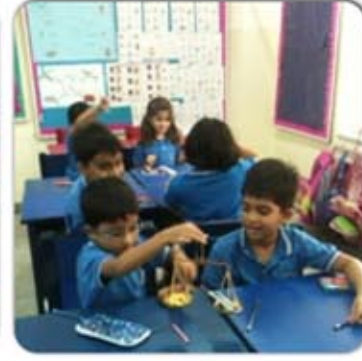
Children trying to balance weights and calculate mass in the Math class.

“We are the same - no matter how we look, who we are and what we do. We must be kind, loving, caring and respectful towards all.”