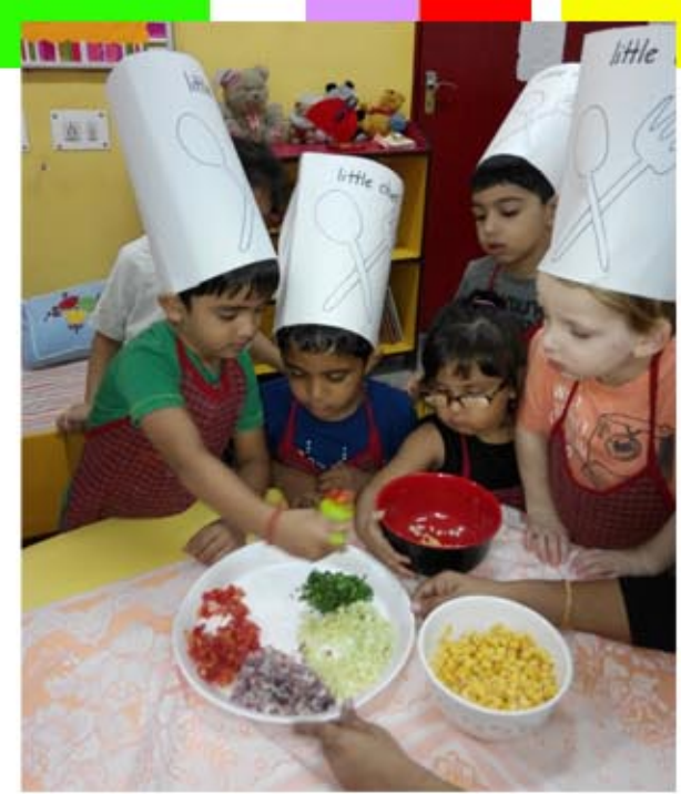
Non flame cooking by the little chefs of Pre Nursery

The children of Pre Nursery learning about colours with the rainbow