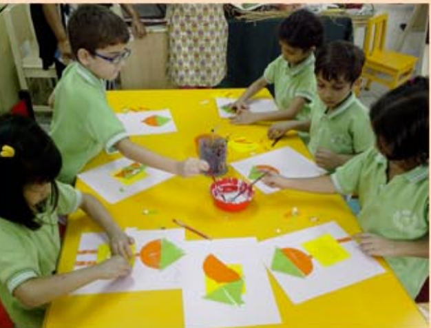
A math activity with shapes