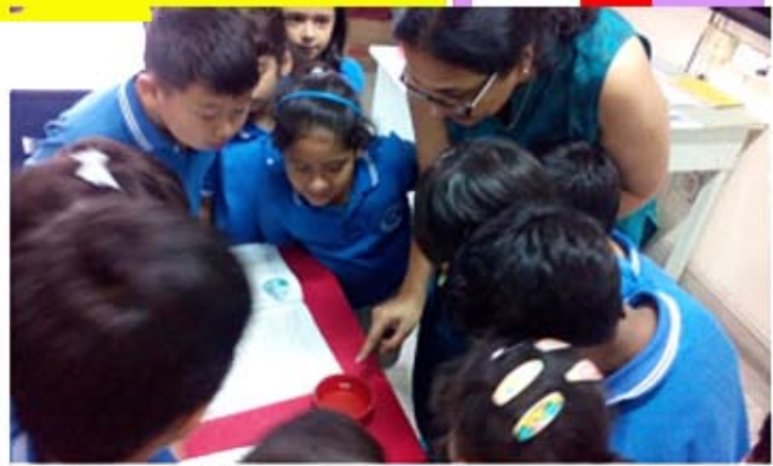
Students of class 1 watching an experiment as part of an Instructional Activity during an English lesson.