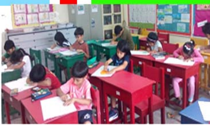
Practicing for Camel Art Contest in the Art and Craft class.